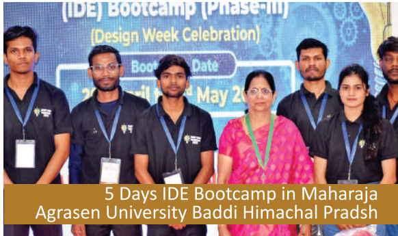
5 Days IDE Bootcamp in Maharaja Agrasen University Baddi Himachal Pradesh