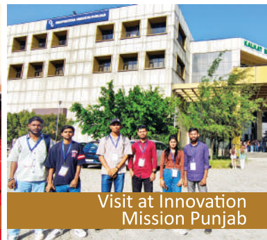
Visit at Innovation Mission Punjab