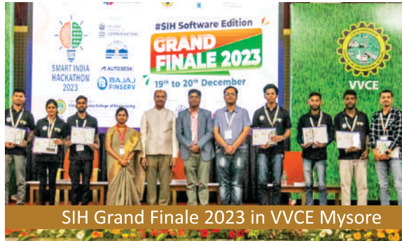
SIH Grand Finale 2023 in VVCE Mysore