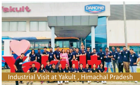
Industrial Visit at Yakult , Himachal Pradesh