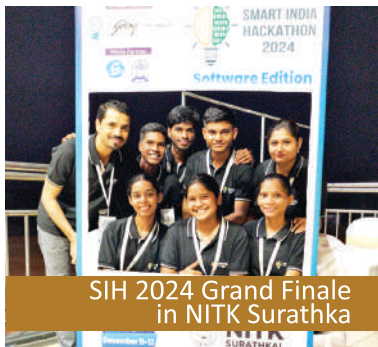
SIH 2024 Grand Finale in NITK Surathka